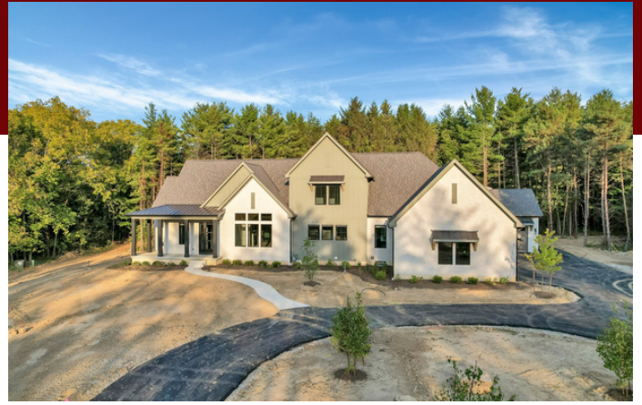
New Build Home in Powell, Ohio

A harmonious blend of modern elegance and warm, inviting functionality. The spaces echo with subtle sophistication, from the sleek lines of the kitchen islands to the thoughtful storage solutions, every detail is a tribute to craftsmanship.